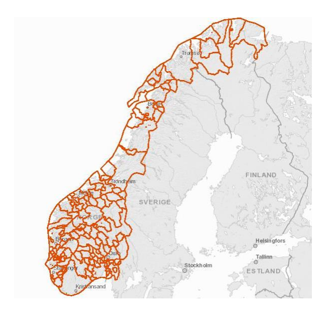
Figure 1: Norwegian electricity distribution service areas