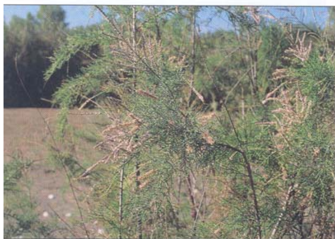
Tamarisk in flower in Big Bend National Park, Texas, USA.

Recent interest in the valuation of ecosystem services has provided tools for assessing the costs of invasive species in natural areas. This study evaluates the economic impacts of tamarisk ( Tamarix sp.), an invasive woody shrub, on societally-valued ecosystem services in its naturalized range. Tamarisk, intentionally introduced from Eurasia, has invaded most riparian areas of the arid and semiarid western United States. In its naturalized range, tamarisk consumes more water than native vegetation, with significant economic implications in a region marked by water scarcity. Tamarisk also increases sedimentation in river channels, leading to increased frequency and severity of flood damage. Conservative economic estimates of these impacts indicate that the annual costs of tamarisk to the western United States total USD 280–450 ha -1 . Eradicating the invader and restoring native riparian communities throughout the region would cost approximately USD 7400 ha -1 . Full recovery of these costs, even with a highly conservative benefits estimate, would occur in as few as 17 years, after which the societal, ecological, and economic benefits of restoration would continue to accrue indefinitely.